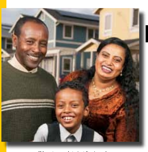
"It's not enough to just live in and own your own house. We belong to a larger neighborhood and community."