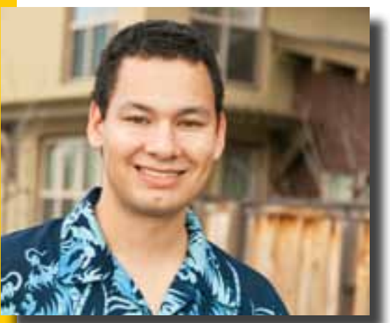
"Art gets me moving and going and thinking and I found it through the help of this place. Now, not only do I have a place where I get to be on my own, but I also have the chance to get out into the world and be active in it."