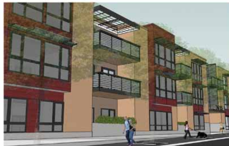
COMING SOON TO FREMONT MAIN STREET VILLAGE

FOSTER CITY, CA | 650-356-2900 | MIDPEN-HOUSING.ORG