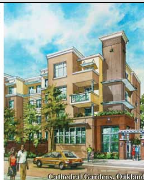
Cathedral Gardens, Oakland

Offices: San Rafael • San Jose Fresno • Honolulu Phone: 415-258-1800