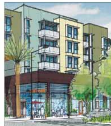
COMING SOON TO UNION CITY STATION CENTER

Thank you, EBHO, for your support of vibrant, affordable communities like these!