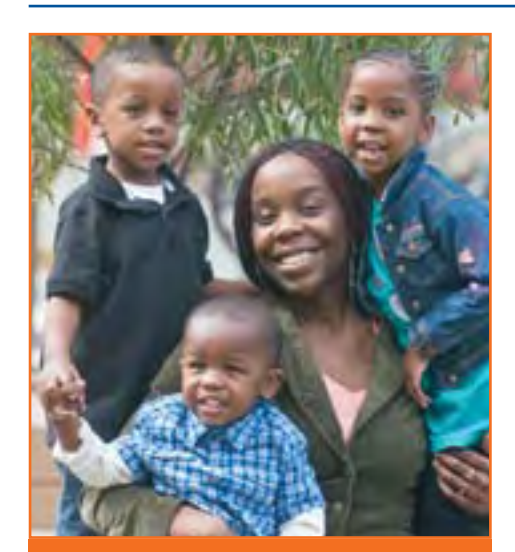
"I'm no longer worried about where we are going to lay our head."

Main Street Village, Fremont — Abode Services and MidPen Housing