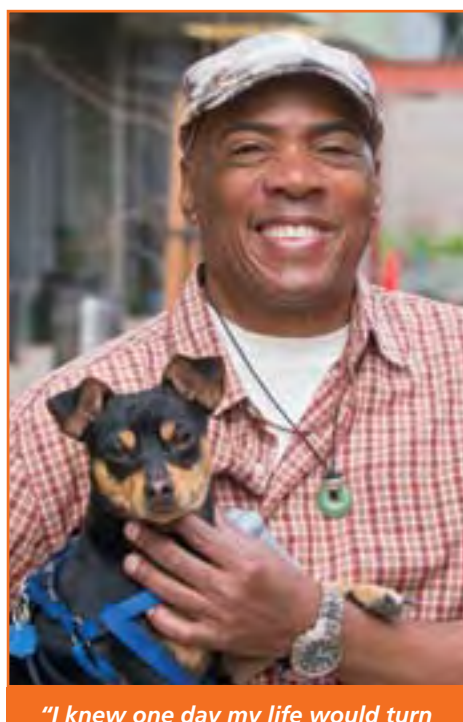
"I knew one day my life would turn around, and it did beautifully."

Merritt Crossing, Oakland — Satellite Affordable Housing Associates (SAHA)