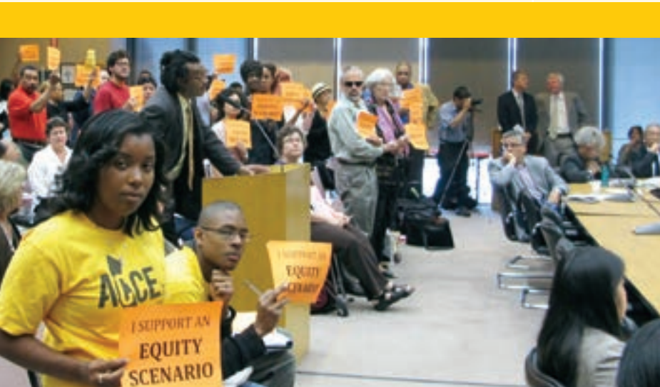
6 Wins Advocates testify at a regional hearing to ensure that equity perspective is heard.

West Oakland is a key example of this trend. Bisected by freeway and BART construction in the 1950s and '60s, the vibrant neighborhood’s African-American community has suffered from decades of polluted air, poor access to basic resources, and under-funded schools and community facilities. As public and private forces now reinvest in West Oakland because of its transit connections and proximity to San Francisco, Oakland’s African-American population, which already declined by one third between 1990 and 2010, faces a new threat. The San Francisco Chronicle explored how waves of new residents are changing the face of West Oakland, and the East Bay Express documented that large real estate investment firms have profited from the foreclosure crisis and helped drive Oakland home prices up 64% from 2012 to 2013. This impact has been felt particularly in West and East Oakland, where predatory lending, followed by foreclosures and speculation