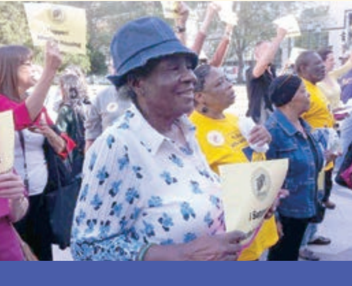
EBHO resident leaders in action.

In the spring of 2013, Oakland’s city leaders declared that the city had no money for affordable housing. By that fall, the mayor, City Council members, affordable housing residents and advocates were all cheering together as the city committed millions of dollars to affordable housing for years to come. How did this happen?