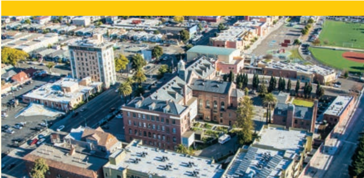
St. Joseph’s, an affordable housing property on a transit-rich corridor in Oakland, is the type of development that can preserve opportunity for residents.

Displacement undermines California’s environmental goals as well. Many people pushed out of the urban core commute long distances in high-polluting cars to return to their old neighborhoods to work, worship and socialize. Ensuring that people of all income levels can live and work in greener, transit-connected neighborhoods is vital to combatting climate change.