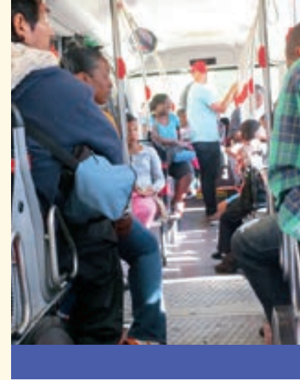
Public transit plays a central role in many people’s daily lives.