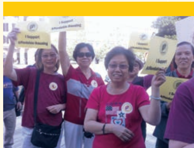
Oakland residents rally to win “boomerang funds.”